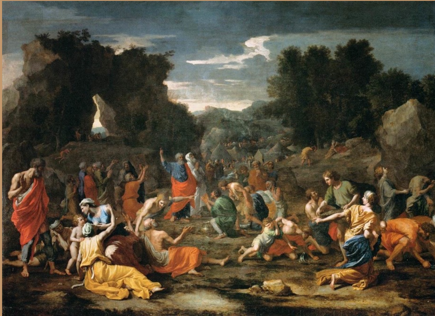
MANNA IN THE DESERT