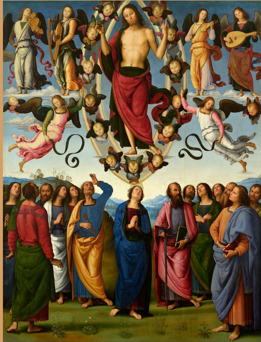
JESUS ASCENDED TO HEAVEN